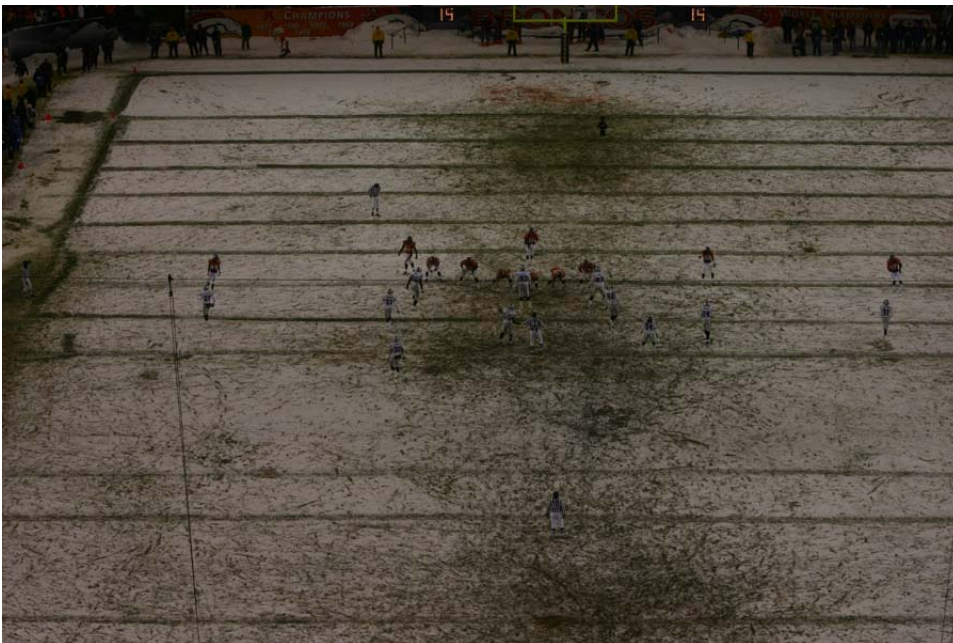
Figure 3 - Oakland at Denver – notice how the white snow caused the camera to underexpose the photograph. This is not a problem as the software can now brighten the photograph and allow you to easily read all of the uniform numbers.