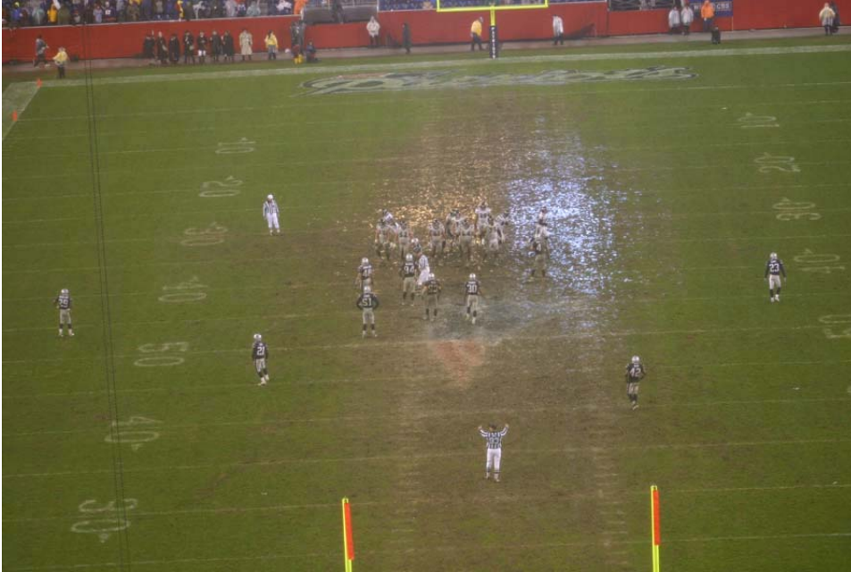
Figure 2 - Baltimore at New England

I have to share some photographs of week 12 games where the weather was pretty bad. Major kudos to the crews working these games under these poor conditions!